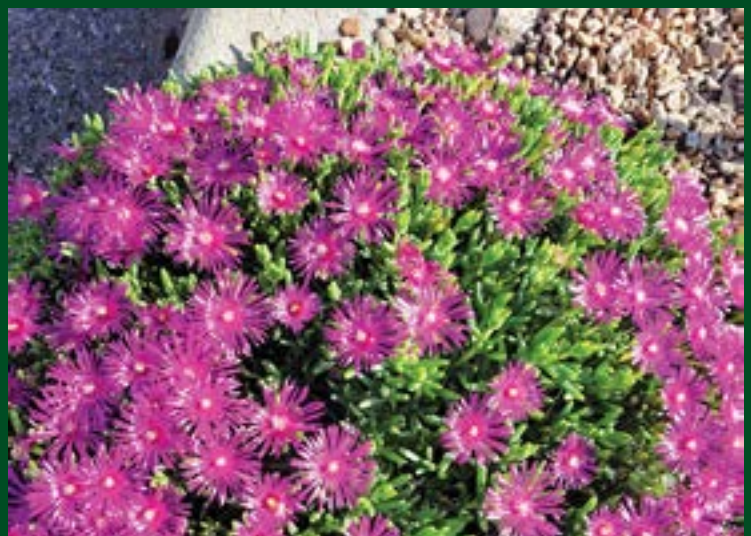
Purple Ice Plant