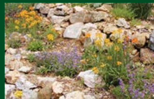
Wallflowers and Blue Mist Penstemons