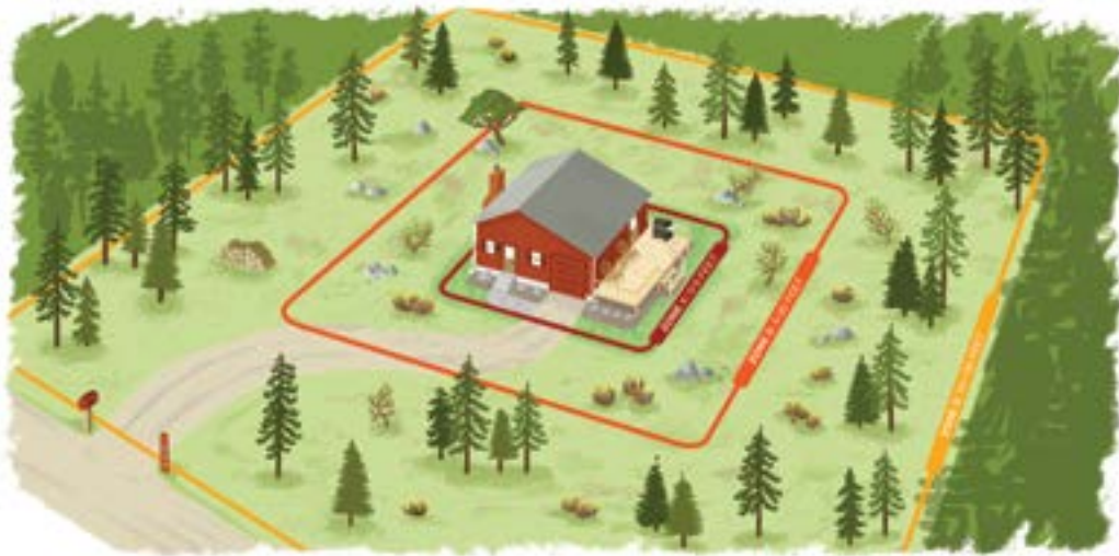
Illustration: Bonnie Palmatory, Colorado State University

This fact sheet covers plants in zones 1 and 2; a different publication; the Fire-Resistant Landscaping fact sheet, discusses plants in zone 3. For a defensible space plan for properties, contact the nearest Colorado State Forest Service field office or local CSU-Extension office for guidance. Consult with a forester, fire department staff or community organization appropriately trained in wildfire mitigation practices.