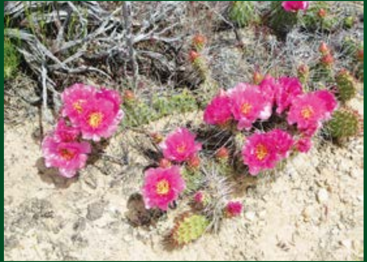
Opuntia

Colorado State University Extension is an equal opportunity provider. | Colorado State University Extension es un proveedor que ofrece igualdad de oportunidades.