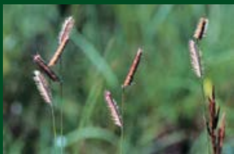
Blue Grama Grass