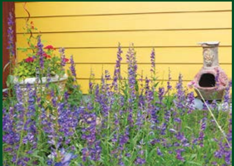
Rocky Mountain Penstemon