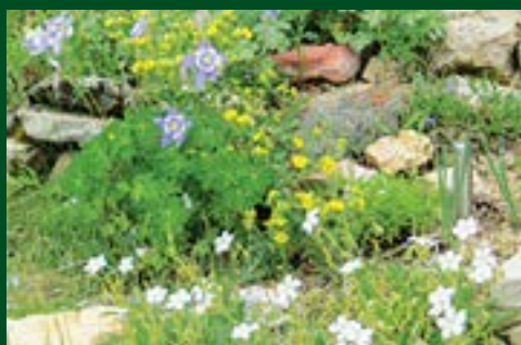
Geranium and Rocky Mountain Columbine